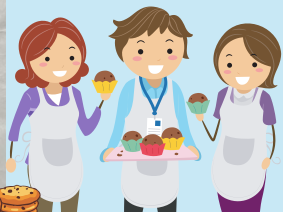
Poster designed by Bella Horton - Year 4